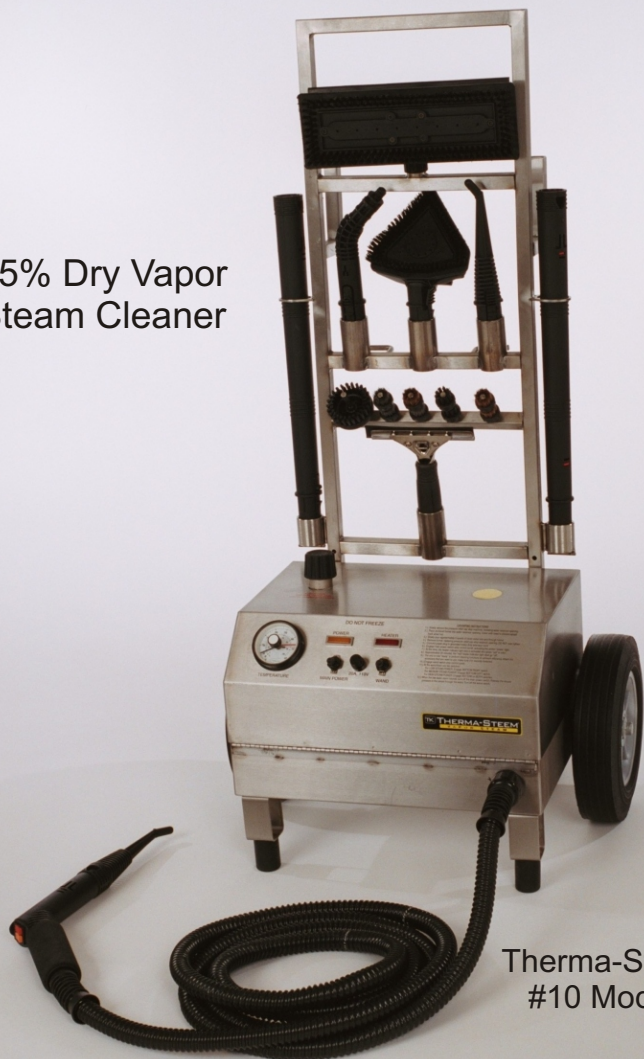
Therma-Steem #10 Model