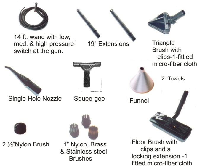
14 ft. wand with low, med. & high pressure switch at the gun.