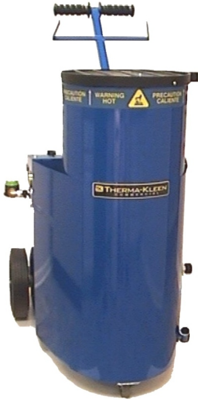
Ultra 1300 Model